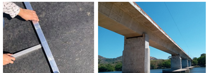
Fig 3: Rutting measurement and bridge inspections

The data collected included roughness, cracking, ravelling, potholes and rutting for use in HDM4, and the area of patching to gauge the maintenance impact on the road. The condition of drainage and bridges was also noted and investigated further.