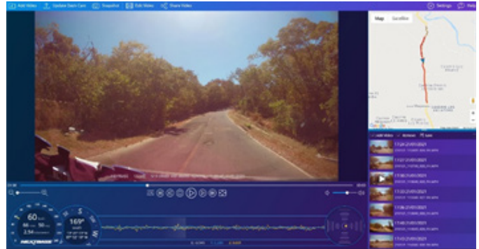
Fig 2: Video and image analysis in the office environment

apps, a dashcam and a low-cost data collection tool developed by TRL, as well as visual IRI using the World Bank scale. The TRL data collection tool measures IRI using accelerometers and gyroscopes and takes high resolution still images of the road that can be analysed in an office environment. Together this equipment was able to collect robust data on the current condition of the road.